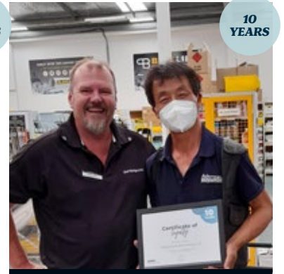
Advanced Plumbing Ltd