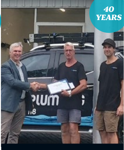
Craig Plumbing Ltd