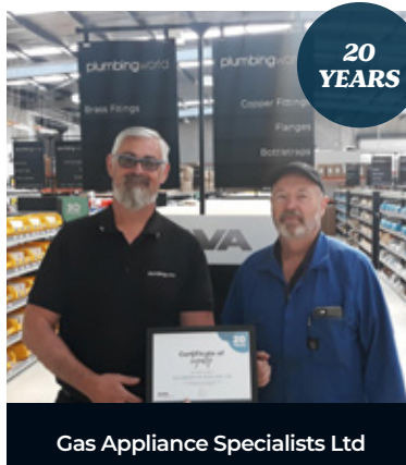
Gas Appliance Specialists Ltd