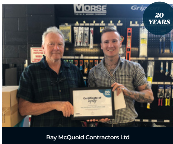
Ray McQuoid Contractors Ltd