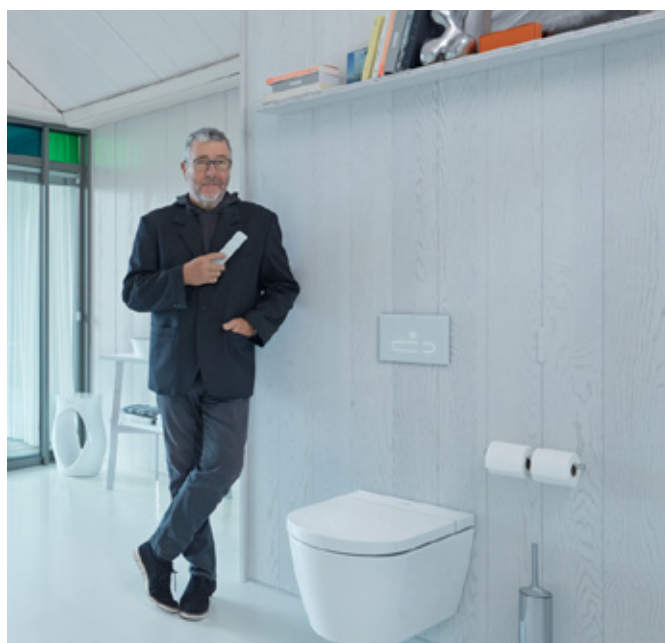
Philippe Starck and the SensoWash® F