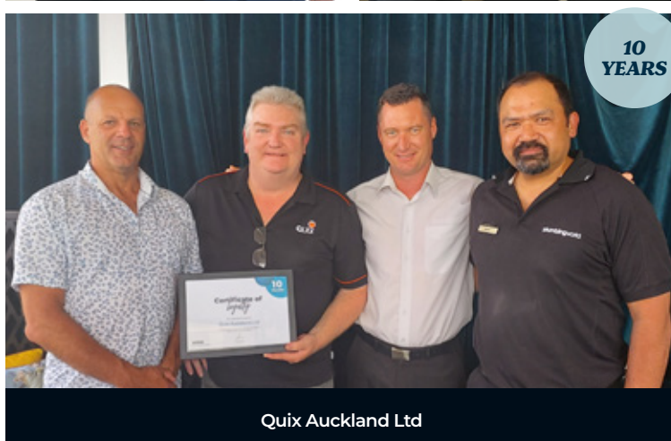
Quix Auckland Ltd