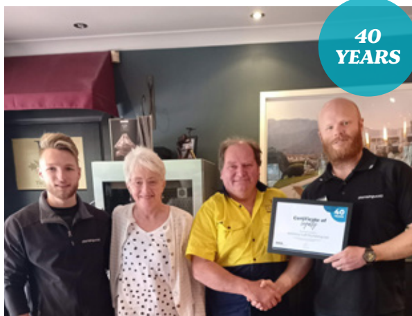
Anthony Cuff Plumbing Ltd

We love celebrating your loyalty to our co-operative and it's great to see shareholders being acknowledged. Congratulations to everyone who has recently received their loyalty awards.