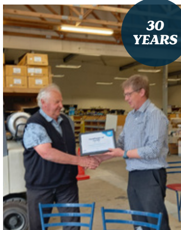
Jamieson Plumbing Ltd