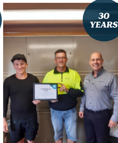
Thompson Drainage Contractors