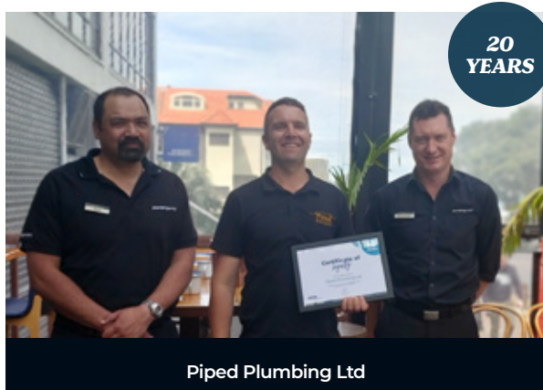
Piped Plumbing Ltd