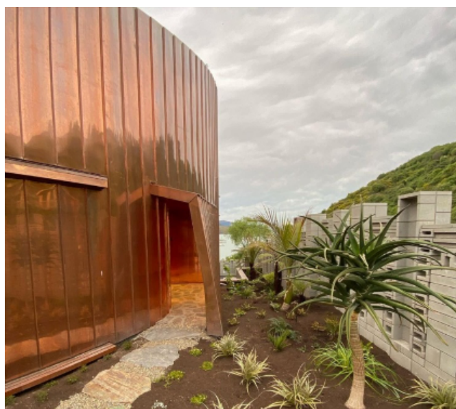
The "Copper Curve" as seen on Grand Designs NZ