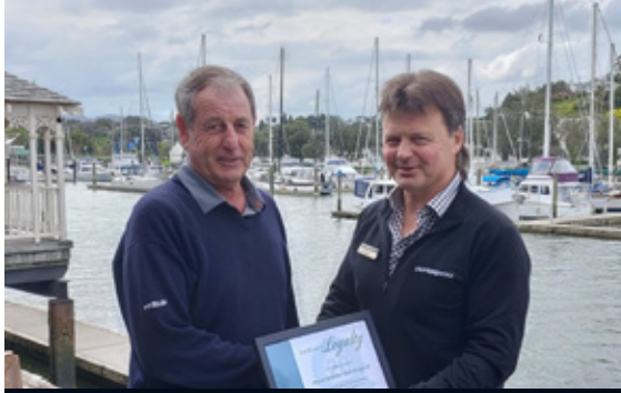
Stuart Butcher Plumbing Ltd 20 years