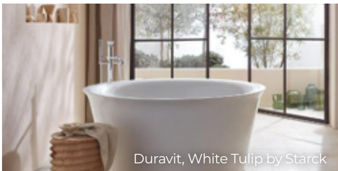
Duravit, White Tulip by Starck

Metrix continues to lead the way with new innovative products that offer a stunning aesthetic combined with the best in European technology. Metrix product is on display at a wide range of Plumbing World stores but for a full Metrix experience our flagship store in Parnell is the perfect place to send your clients – we can also do a Zoom consultation so they can experience a walk around the showroom if you are outside the Auckland region.