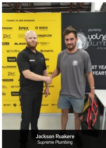
Jackson Ruakere Supreme Plumbing