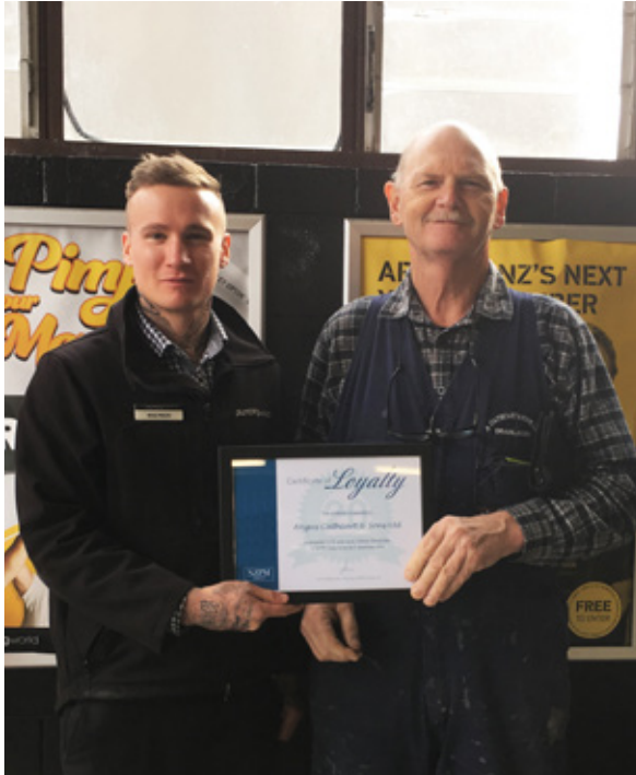
Angus Cathcart Angus Cathcart & Sons Ltd