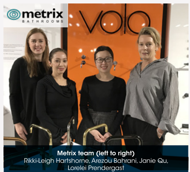
Metrix team (left to right)

So far in 2018 the Parnell showroom team are producing quotes with a total value 55% higher than last year, which is an excellent result, and evidence that the team are living our values.